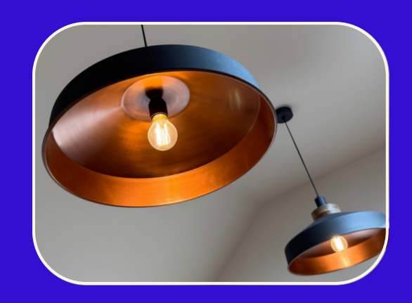
ELECTRICAL INSTALLTION COMPLETE