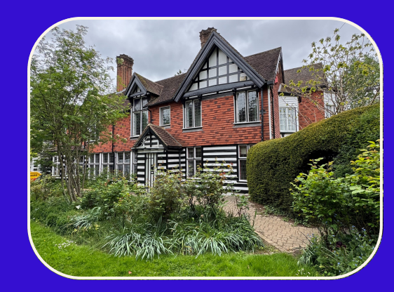
LARGE RESIDENTIAL PROPERTY-FULL REWIRE